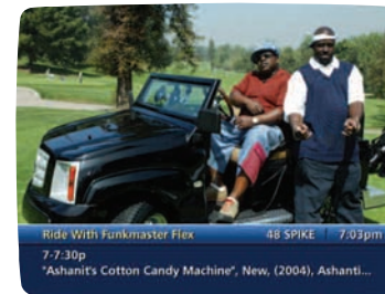
When you find a program you like, press OK to make the Flip Bar disappear or press INFO for more program details.