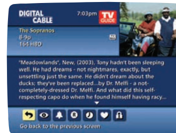
Use the arrow ◀▶ buttons to highlight an icon, a description will appear just below the icons.

The Mini Guide lets you watch television and view listings without having to leave your program. To access, press OK or INFO then use the ◀▶ buttons to browse time and use the ▲▼ buttons to browse channels.