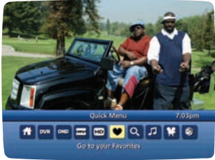
Press the OK on your remote to highlight an option, press OK and you're on your way.