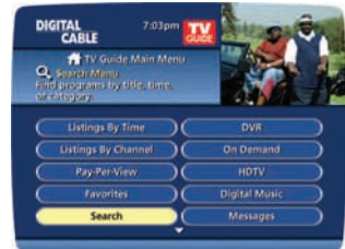
Press MENU button twice for the Main Menu .